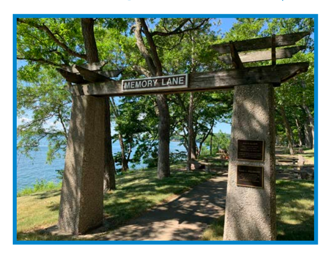
A peaceful lakeside walkway between Roger Williams Inn and the Vesper Circle at Green Lake Conference Center