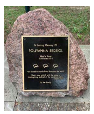
18" x 15" bronze plaque on large stone $17,000