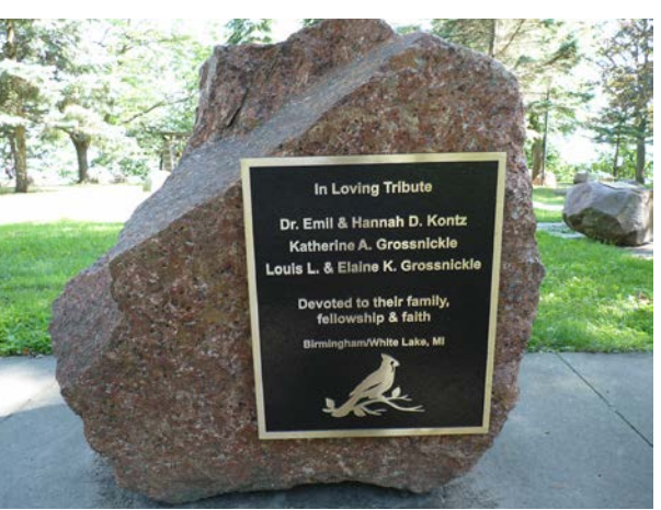
18" x 15" bronze plaque on large stone $17,000