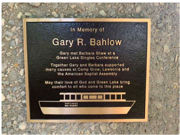
12" x 10" bronze plaque on arbor $6,000