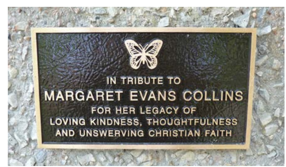
9" x 5" bronze plaque on arbor $3,000