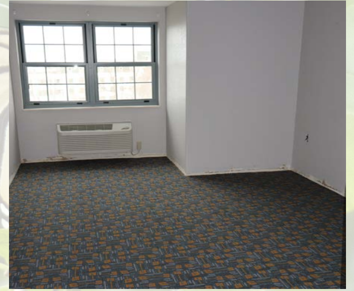
New carpet in guest rooms