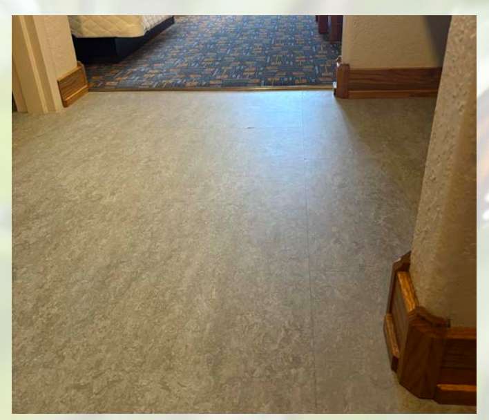
New marmoleum floors in bathrooms

Bauer Lodge has been transformed with new carpet, paint, bathroom floors and oak baseboards