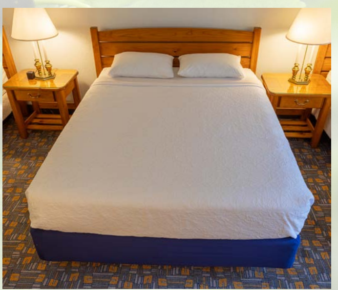
Bauer guest room after (sample of new bedding that will be added soon)