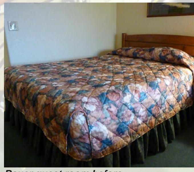
Bauer guest room before