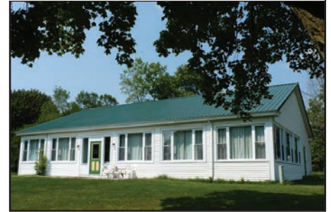
GREEN DOOR (capacity: 24): Two rooms with six bunk beds in each; four bathrooms and four showers. A/C