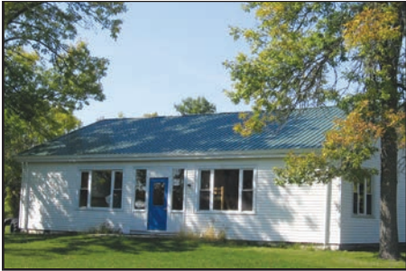
BLUE DOOR (capacity: 22): Two rooms with five bunk beds in each; three bathrooms and three showers. A third room sleeps two.

Bunk Cabins are seasonal and must be reserved for two nights minimum. They are near camping areas, have a dorm feel and are not on the lake. Guests bring their own sheets, blankets, pillows, towels and washcloths. Bunk Cabins are ideal for youth groups.