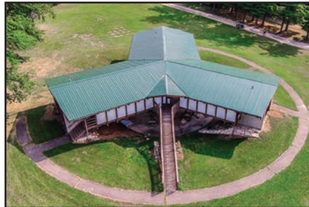
BROWN DOOR (capacity: 30): Two rooms sleep twelve and one room sleeps six, all bunk beds; six bathrooms and six showers. A/C