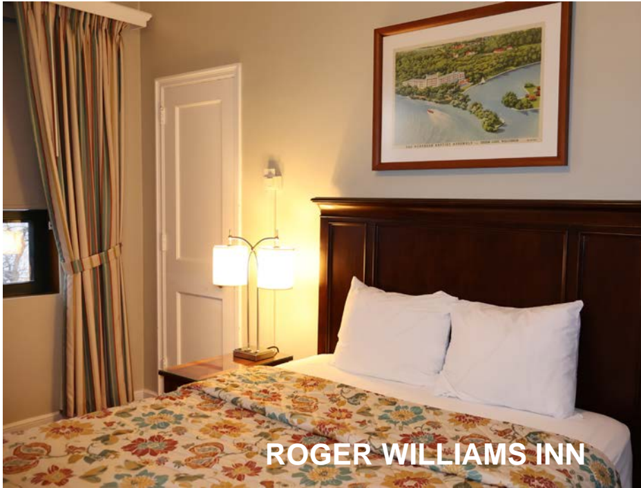
ROGER WILLIAMS INN

ROGER WILLIAMS INN was built in 1930 and has 65 rooms, most with a lake view, which accommodate 1 to 4 people each. This historic hotel has a lobby with floor-to-ceiling windows with a lake view. The Penthouse, located on the 5th floor, has spectacular lake views and accommodates 9 people in three rooms. Three meeting rooms are located off the 1st floor lobby.