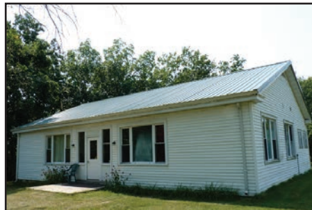
WARNER-KALLMAN (capacity: 23): Two rooms with five bunk beds in each; three bathrooms and three showers. A third room (with bathroom) sleeps three.