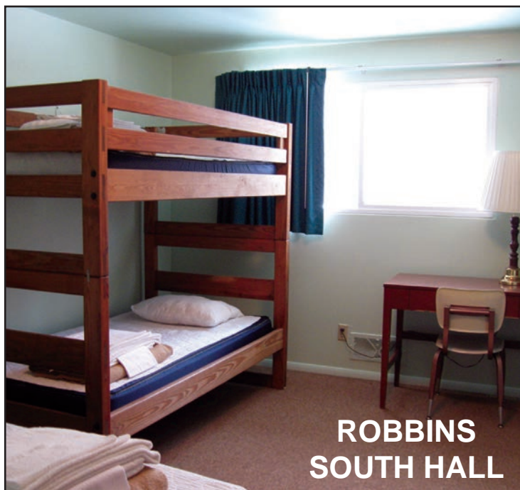
ROBBINS SOUTH HALL