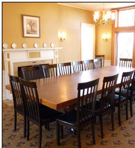
Christian Writing Center dining room

Christian Writing Center Apartment Cozy apartment behind the Christian Writing Center. One bedroom, one bath, kitchen and living area; Wi-Fi. Cap. 4 (2 queens)