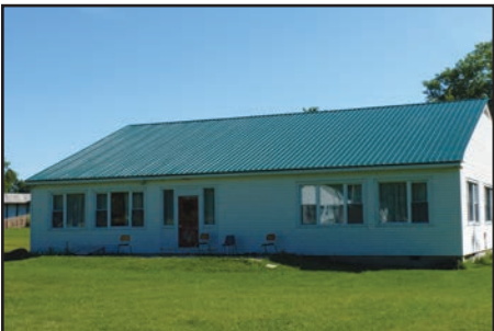
RED DOOR (capacity: 12): One room with 6 bunk beds; two showers and two bathrooms. The other half of the building is meeting space. A/C