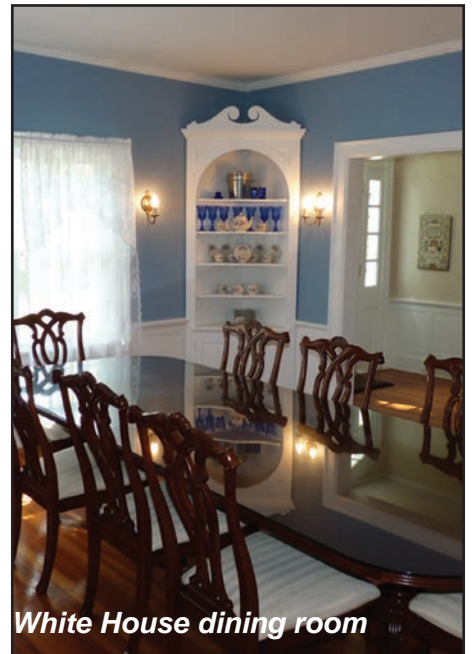
White House dining room